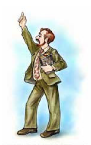
ine gender or the character portrayed does not limit this gift, or any gift, to any particular gender

That does not mean you are supposed to have visions of the future. It means you are a "forthteller," telling or "speaking forth" the mind of God: preaching, speaking, and teaching God's Word. You are very discerning; one who points out sin with the goal of making Christians aware of sin in their lives so they will repent. A prophet in full-time Christian service is usually a "hell-fire, brimstone preacher." You have the Spirit-given capacity and desire to serve God by proclaiming His truth.