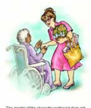
The gender of the character portrayed does not bent this off, or any off, to any particular people.

The Greek word "ellco" means to feel sympathy with or for others. As a mercy-shower you have the Spirit-given capacity and desire to serve God by identifying with and comforting those who are in distress. You understand and comfort your fellow Christian. You enter into the grief or happiness of others and have the ability to show empathy which is to feel WITH others, not just for others.