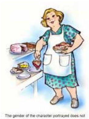
The gender of the character portrayed does not mit this gift, or any gift, to any particular gender.

The Greek word "Diakonia" means to do service. In Acts 6:1 the word is interpreted "ministration." Our word deacon comes from the same Greek word. Actually the gift of serving combines helps and ministering. The word "helps" is used in 1 Corinthians 12:28 and "ministering" in Romans 12:7. As a server you have the Spirit-given capacity and desire to serve God by rendering practical help in both physical and spiritual matters. You enjoy meeting the practical needs of your fellow Christians and the church.